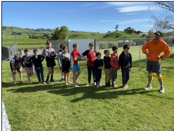
Athletics with Whakatutuki

Weds 11 th November Masterton Athletics Day Thurs 12 th November SCHOOL TRIPS Mon 30 th November BOT Meeting – 5.30pm Tues 1 st December Water Skills Day – Swim NZ Fri 4 th December Beach Education Day – Riversdale Mon 14 th December Prizegiving and Dinner – 5pm Tues 15 th December Term 4, 2020 Final Day – 1pm finish